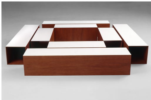
Nasser Bouzid, Sans titre , 1990, FNAC 91436, Centre national des arts plastiques.