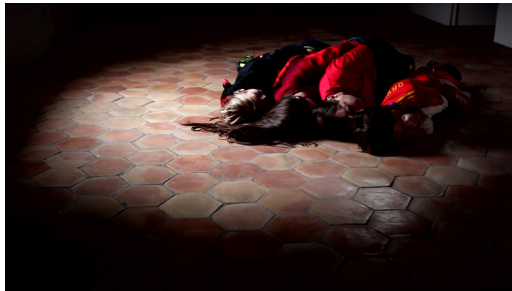
Halida Boughriet, Corps de masse , 2014. © Adagp, Paris 2021.