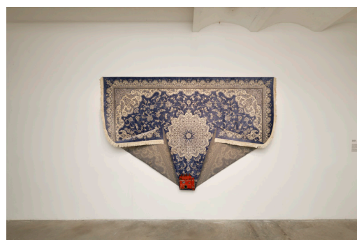
Exhibition view "En attendant Omar Gatlati", Triangle - Astérides, Centre d'art contemporain, 2021. Sadek Rahim, Made in the USSR , 2019.