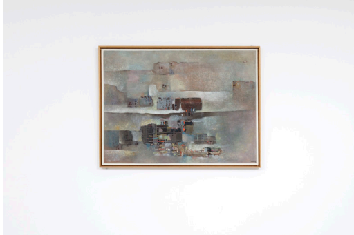
Exhibition view "En attendant Omar Gatlato", Triangle - Astérides, Centre d'art contemporain, 2021. Abdelkader Guermaz, Paysage absurde , 1976, FNAC 32 433, Centre national des arts plastiques.