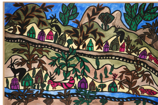
Baya, Paysage aux maisons et collines , 1966, FNAC 29677, Centre national des arts plastiques, long-term loan at musée du quai Branly - Jacques Chirac.